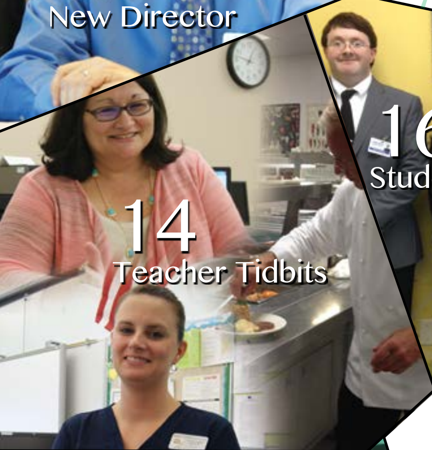
14 Teacher Tidbits