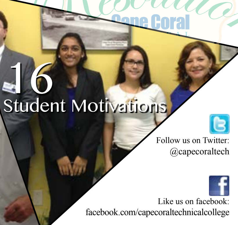
16 Student Motivations

Cape Coral TECHNICAL College Established 1993