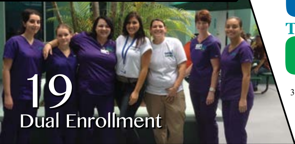
19 Dual Enrollment