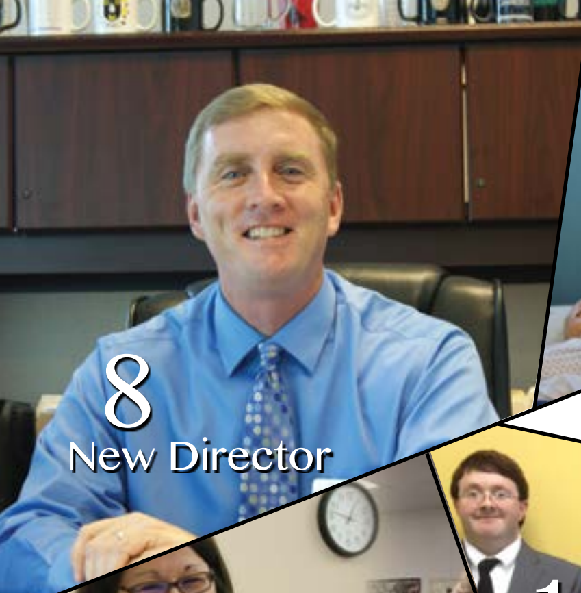
8 New Director