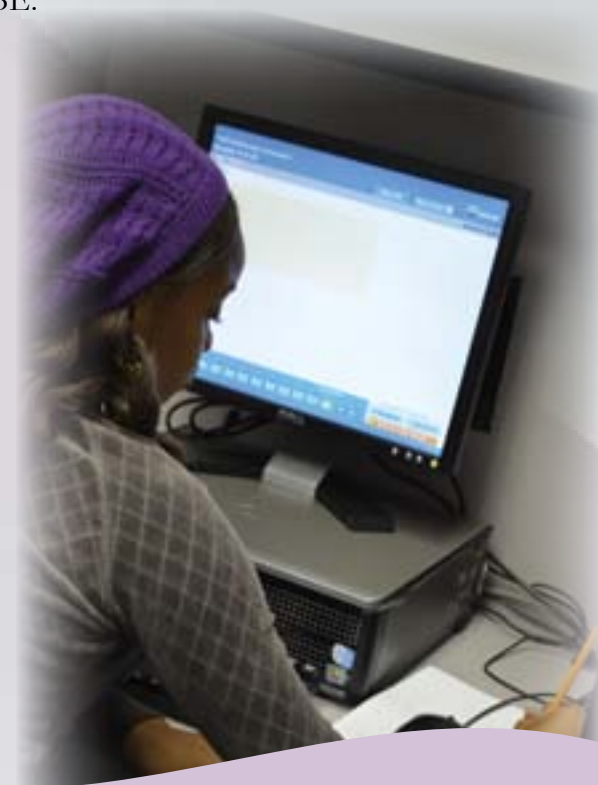
A Student Preparing for the GED Test

The TABE had a testing fee of $15, and covers the following areas: reading, math computation, applied math, language, and spelling. The TABE test scores allow the Learning Center instructors at High Tech North to know the strengths and weaknesses of individual learners. After passing the practice test for GED, you can sign up and take the test at the Adult Education Center in Fort Myers. The passing GED scores require a total score of 2,250 and no individual section can score below 410, with an average score of 450.