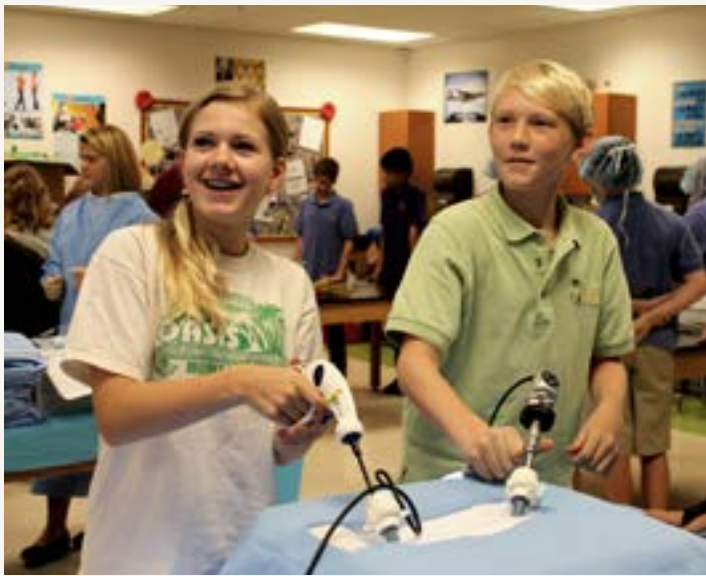
Students Using Laparoscopic Tools