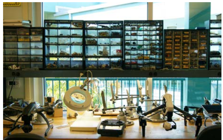
Electronic Technology student workspace

“ THE ABILITY TO ASSEMBLE A DRONE, TAKE IT OUTSIDE AND WATCH HOW IT WORKS IS FASCINATING. ”